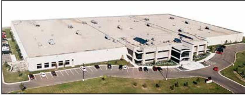
Headquartered in Anoka, Minnesota, in a 300,000 sq. ft. (28,000m 2 ) state-of-the-art facility.